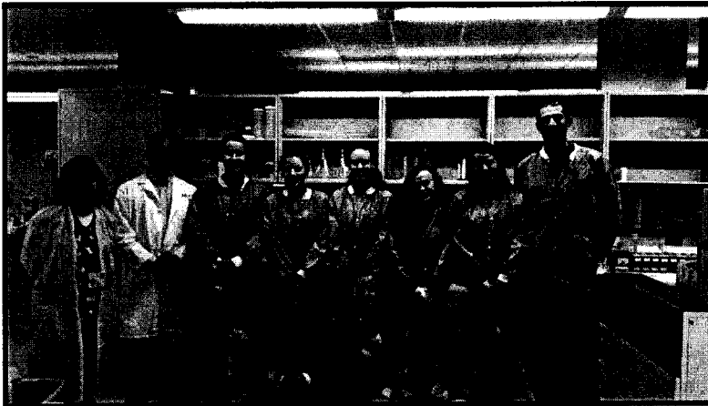
AHS students with teacher and their Lab tour guides